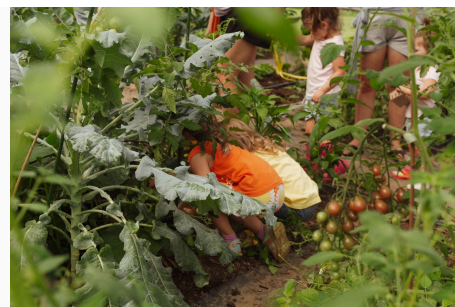
Young Harvest's Little Gardeners Workshop

No garden? No problem. Visit inclusive spaces like Young Harvests Farm for community sensory events that invite families to explore, grow, and connect through nature—together.